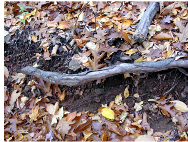
Scenes from Bishop Woods Bird Sanctuary: beautiful hardwood stand (top); root exposed from tire abrasion (center); dirt biker (bottom)

Bishop Woods, and fewer still venture inside. Underuse by families, hikers and naturalists has contributed to terrible abuse of this lovely landscape.